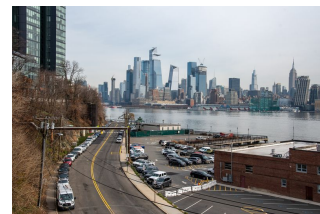
Hoboken Plans New Sinatra Drive Bike Path, Design Upgrades