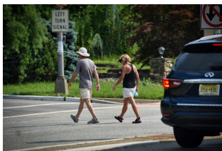
Pedestrian Deaths in North Jersey Streets Continue to Rise