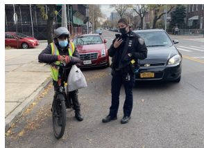
NYPD’s Racial Bias in Ticketing Cyclists Continued Last Year